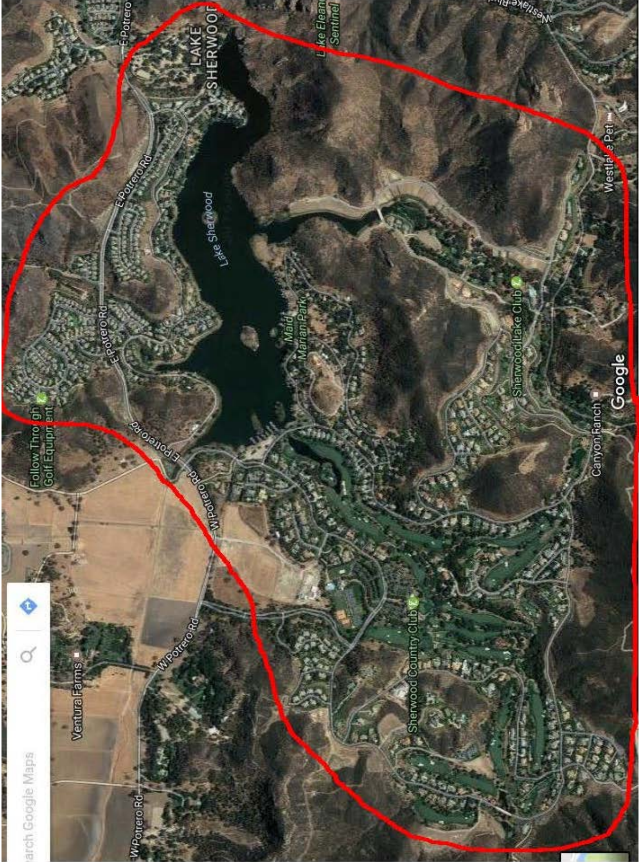
TSD – CUP 4375 Boundary – includes all Tracts listed on summary